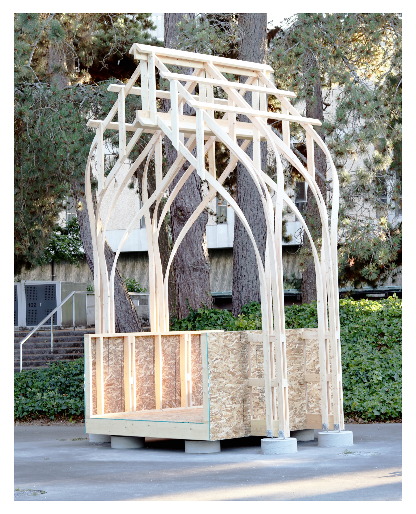
Figure 4. Completed pavilion by HiLo Lab.